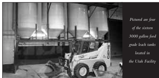
Pictured are four of the sixteen 3000 gallon food grade leach tanks located in the Utah Facility

plant minerals available today. This comprehensive blend of plant minerals provides incredible nutritional benefit when used in food supplements or in formulations of processed foods. These minerals also blend very well with animal feeds to enhance nutritional value beyond anything imaginable! They contribute significantly to plant growth and increased nutritional value when used in minute amounts as fertilizer or foliate.